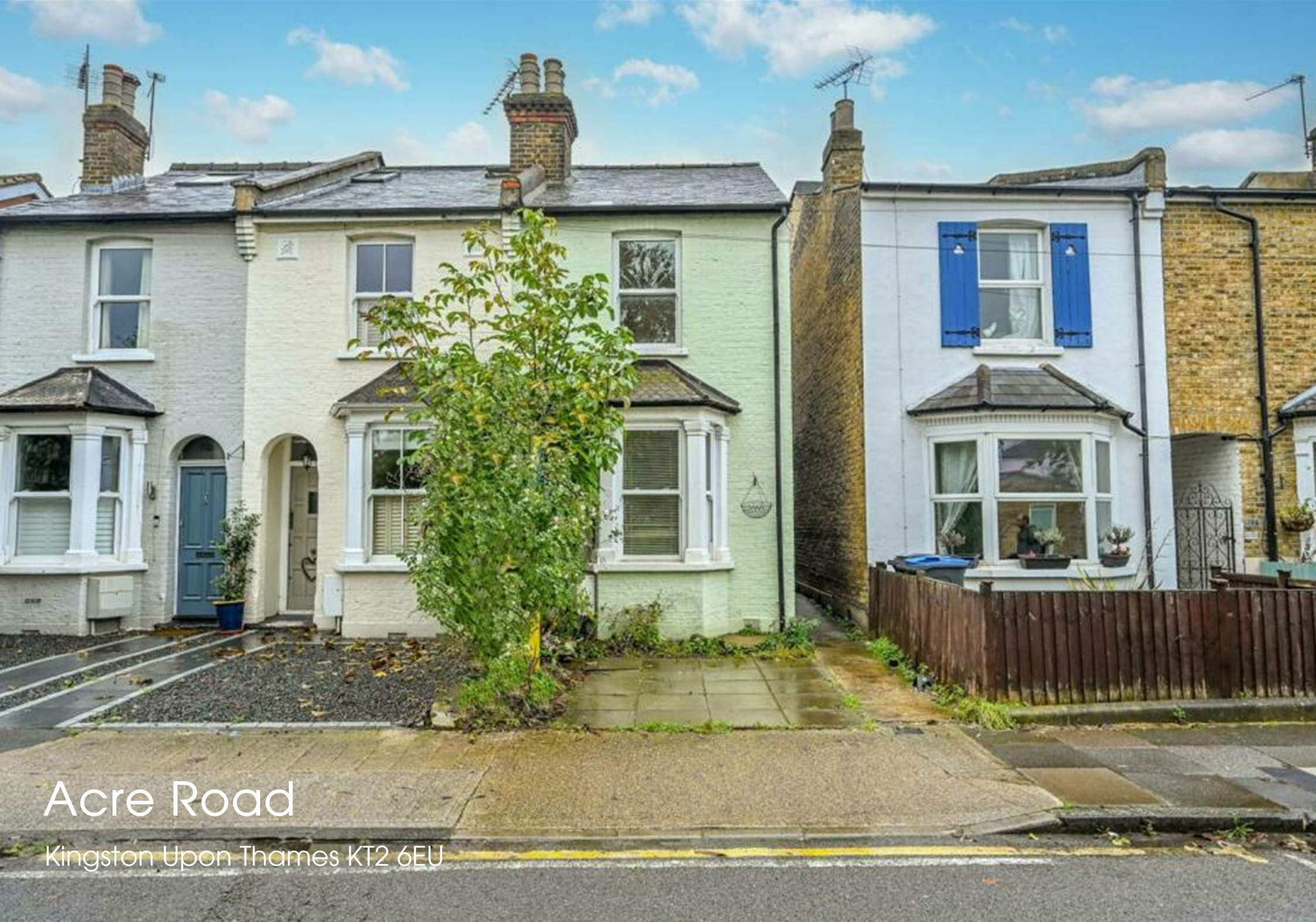
Acre Road Kingston Upon Thames KT2 6EU